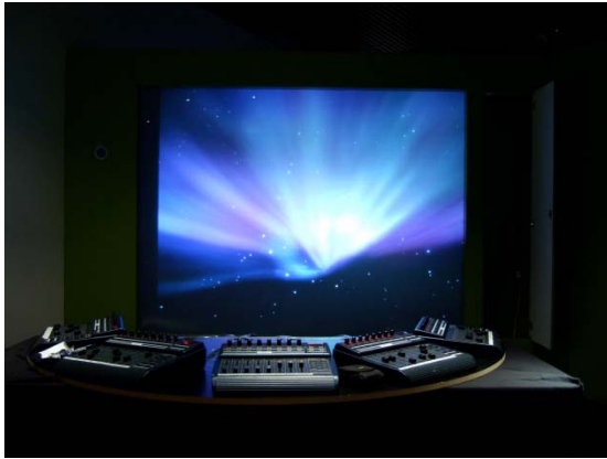
Fig. 18-3. AV Jam (See examples: http://www.explodingart.com/networkjamming/ )