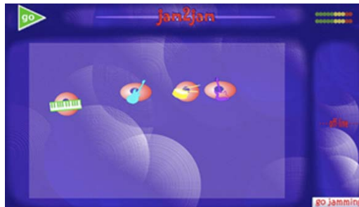
Fig. 18-2. Jam2jam blue (See documentary: http://www.youtube.com/watch?v=Y08fTYdiJGA )

Jam2jam blue was designed to provide a more focused musical agenda and look more like a computer game interface. Rather than work with music technology style mixer interfaces, this interface takes its design metaphor from the computer games industry. It is aimed more squarely at early childhood and early primary year's users. Musically it uses a simple hip hop like algorithm again drawn from children's musical preferences and interest. The trial version has two axis of control: movement of the instrument icon up and down controls volume and movement from left to right controls density of note activity. In gathering data about participant's interaction with this interface we developed a digital video recording process we called "Kid Cam." This video observation strategy involved a multi camera setup where the users face, the screen activity and software sound are captured alongside a camera which captured multi users in the whole room. These data were analysed using a video analysis software called Interact (2007). This software enables the searching, coding and synchronisation of multiple video sources.