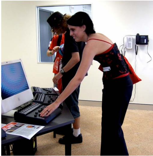
Fig. 18-4. Young people using AV-Jam USB controllers